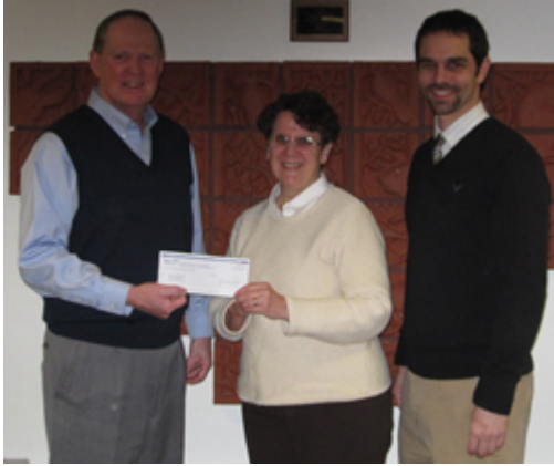
Insurance and Financial of Camden.

The Hope group has been reaching out to local businesses as they work to raise the $136,000 needed to fund this project. A matching grant has been donated when the group reaches the $50,000 mark. The result of this effort will be the school's first fully-equipped science lab.